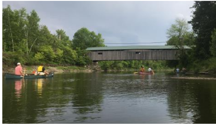
Lamoille River Access, Cambridge