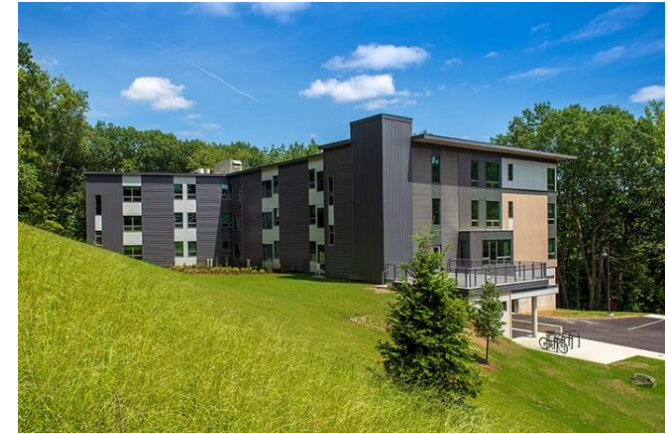
Wentworth Housing II, Hartford