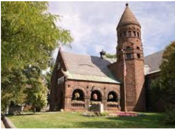
Fairbanks Museum, St. Johnsbury